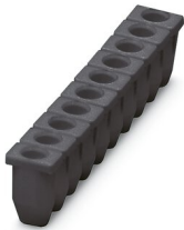
Insulating sleeve, color: black

https://www.phoenixcontact.com/in/products/3002869