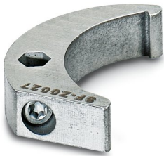
Hook wrench, series: RC

https://www.phoenixcontact.com/in/products/1607455