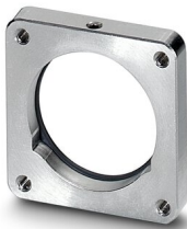
Square mounting flange, Axial seal, 4xM3, flange dimensions: 35 mm x 35 mm, series: RF, Alternative product in accordance with RoHS II without Exemption 6c (Pb <0.1%) item no.: 1242369

https://www.phoenixcontact.com/in/products/1607905