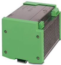
Power supply unit, primary switched-mode, input 120 V AC, output 12 V DC/10 A, with filter

Please be informed that the data shown in this PDF document is generated from our Online Catalog. Please find the complete data in the user documentation. Our General Terms of Use for Downloads are valid.